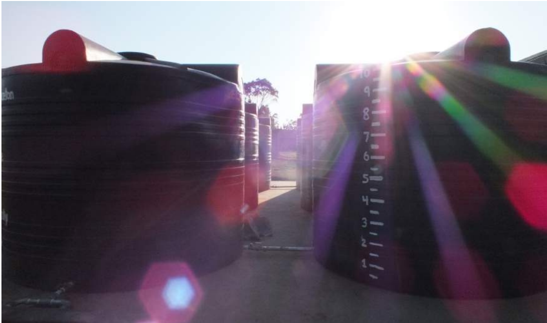
Figure 1: Photo of the completed rainwater catchment system tank cluster for Muchebe Village.