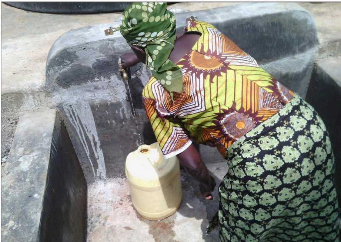
Figure 4: A community member collecting water from the completed system.