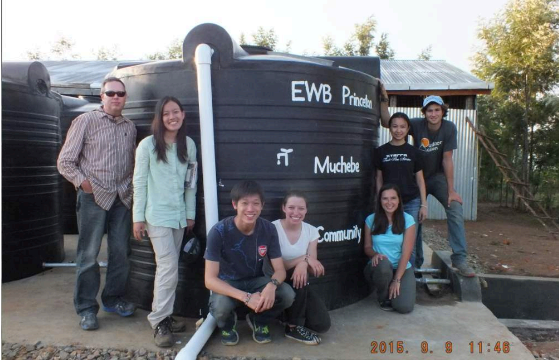
Figure 2: The EWB-Kenya team posing with the completed system.